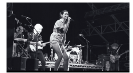
Torchlight Festival, UK 2023