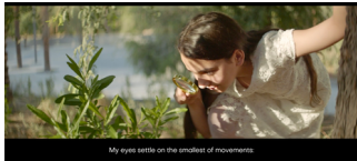
Al Fay Park TVC campaign 2022