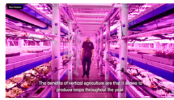
Badia Farms, the first vertical farm in the Gulf 2018