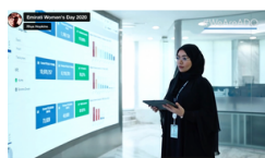
Emirati Women's Day campaign for ADQ 2020