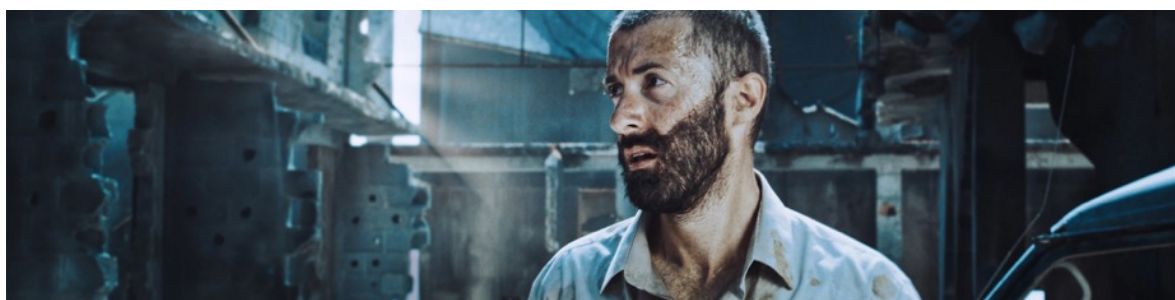
Filming “The Brave” for ISNR show. A film integrated in a live stage performance for the Abu Dhabi government across 60m of screens.