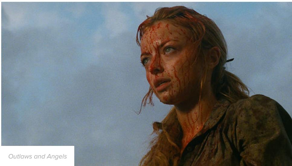
Outlaws and Angels