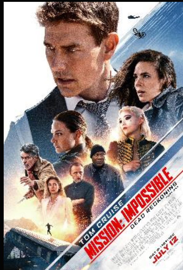
Mission Impossible Dead Reckoning 1/2 Format: Hollywood Movie Year: 2023 Role: Casting Extras