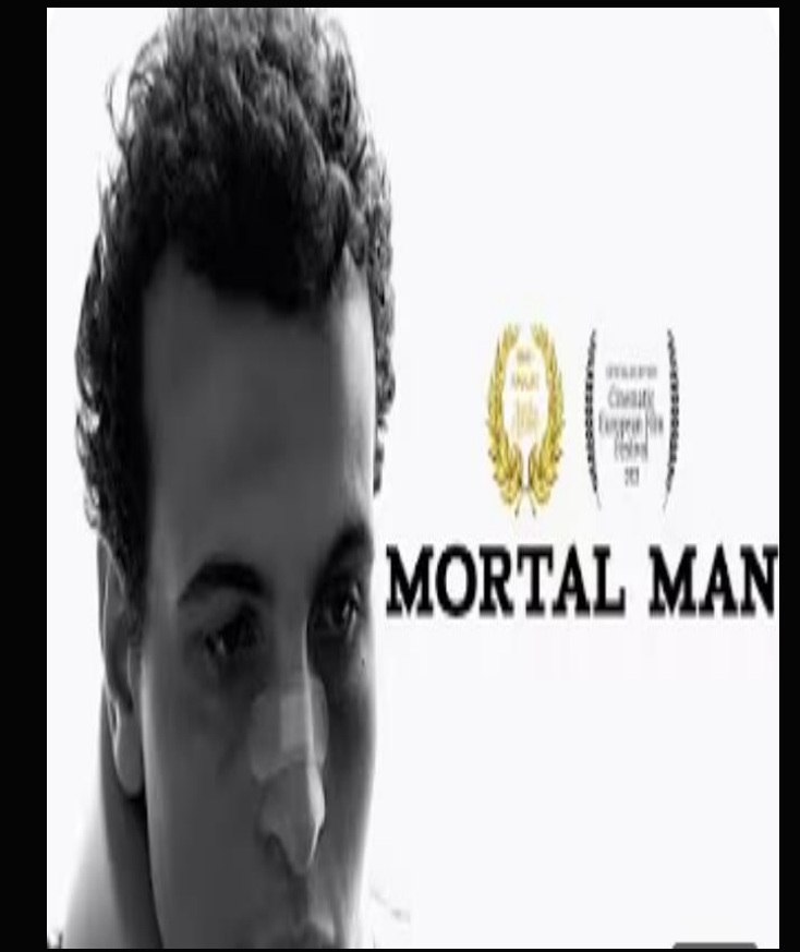
Mortal Man Format: Short Film Year: 2021 Role: Casting Featured and Extras