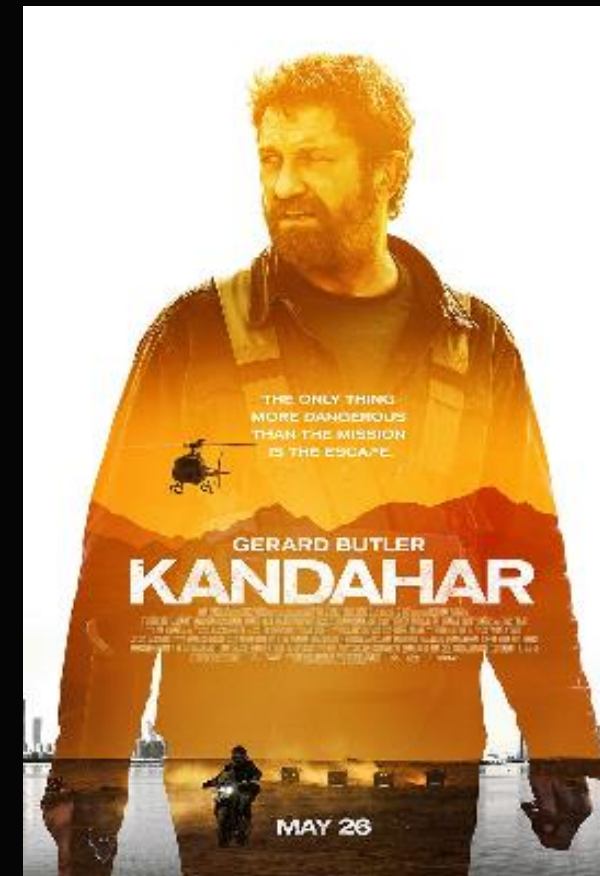
Kandahar Format: Hollywood Movie Year: 2023 Role: Casting Featured and Extras