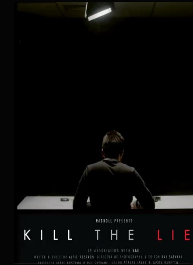
Kill the Lie Format: Short Film Year: 2021 Role: Casting Featured and Extras