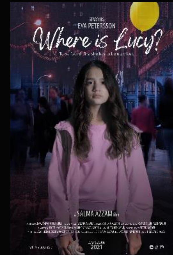
Where Is Lucy? Format: Short Film Year: 2021 Role: Casting Featured and Extras